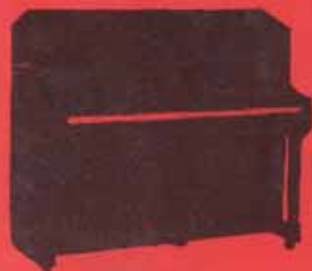
NEW MODEL LIEDER PIANO